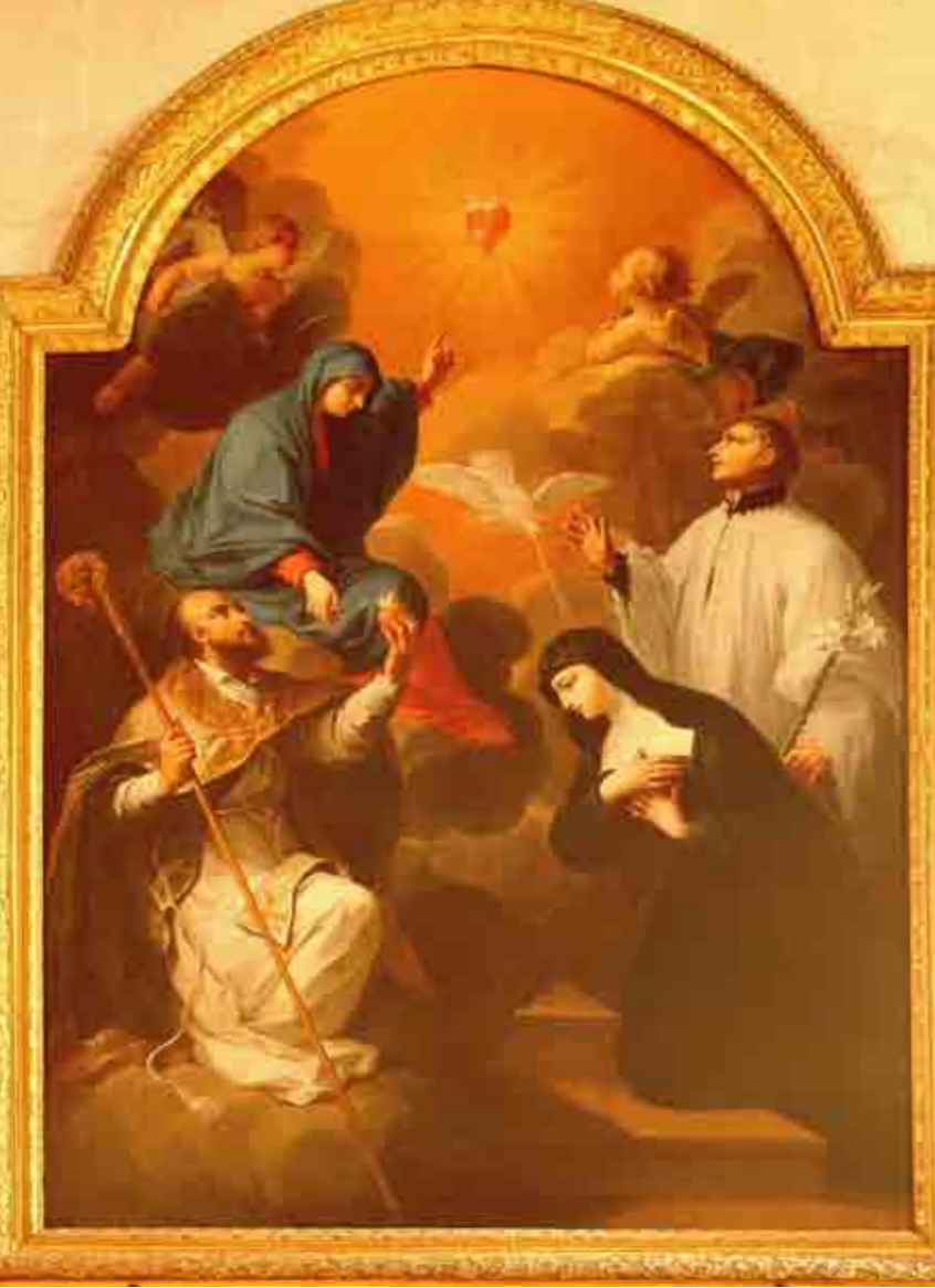
Saint Jane de Chantal and Saint Francis de Sales Offering Their Hearts to the Holy Virgin, Caprentras Cathedral.