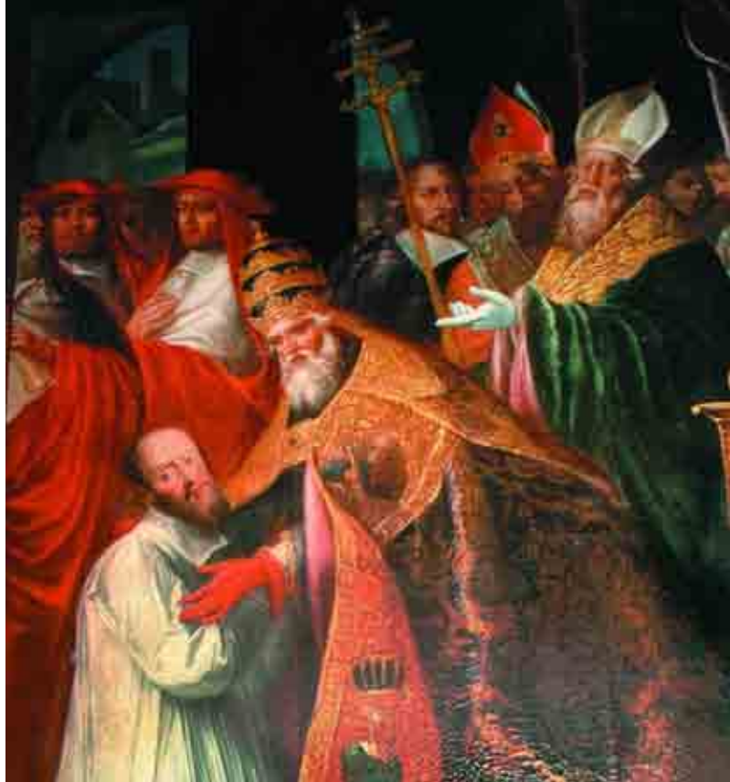
Saint Francis de Sales before Clement VIII Troyes, Saint John-in-the-Market.

Until his death in 1622, he criss-crossed his diocese, organising catechesis for adults as well as for children, regulating the life of his clergy, and reforming several religious communities. He also preached numerous retreats, notably at Dijon (in 1604), where he met the Baroness de Chantal; at Chambéry (in 1606); and at Grenoble (in 1616, 1617 and 1618). He was in Paris for the last time from Novem-