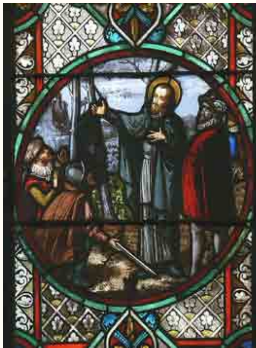
Saint Francis de Sales Converting the Protestants Sent to Assassinate Him, stained glass window in the Church of Saint Francis de Sales, Paris.

“Whatever we do, the world will find fault; if we spend a long time at Confession, it will ask what we can have to say; if we take but a short time, it will say that we do not tell everything; it will spy out all we do, and from one little hasty word it will pronounce our temper unbearable; it will denounce our prudence as avarice, our gentleness as folly; but as to the children of the world their passions will pass as the fruit of a generous spirit, their avarice as forethought,