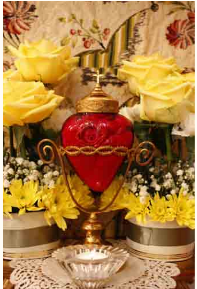
Gricigliano, Relic of the Heart of Saint Francis de Sales offered by the Visitation Monastery of Treviso.

nature and, as a director of souls, worked towards strengthening his spiritual children against sin.