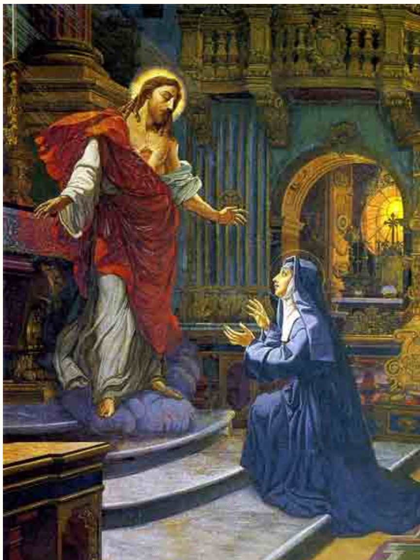
Our Lord Appearing to Saint Margaret Mary, Saint Peter’s Basilica, Vatican

The 129 French convents were dispersed in 1793. In 1805, the order was re-established in France; today it counts nearly 150 active convents around the world.