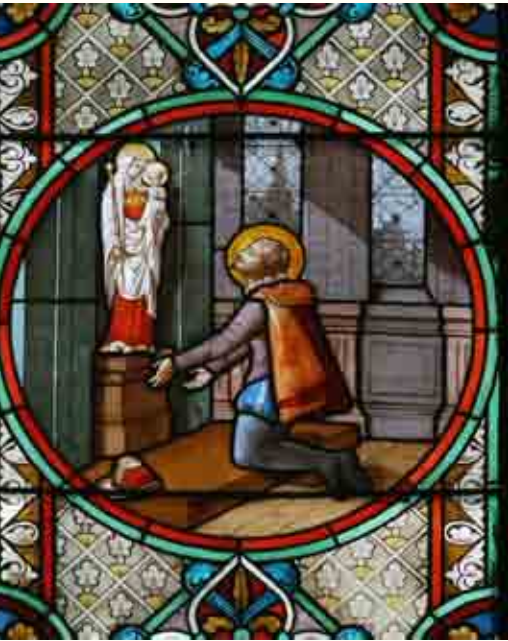
Saint Francis Praying to Our Lady, stained glass in the Church of Saint Francis de Sales, Paris.